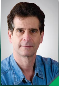
Keynote Speaker Dean Kamen

PLUS: KEYNOTE BY RENOWNED ENTREPRENEUR AND INVENTOR DEAN KAMEN