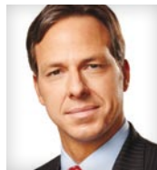
Jake Tapper Chief Washington Correspondent & Anchor, "The Lead with Jake Tapper" CNN