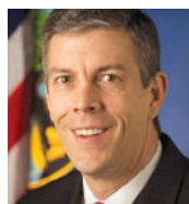
Arne Duncan Secretary U.S. Department of Education