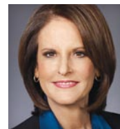
Gloria Borger Chief Political Analyst CNN