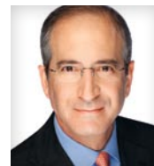
Brian Roberts Chairman & CEO Comcast Corporation