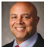
Michael Powell President & CEO NCTA