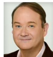
Marc Cherry Creator and Executive Producer "Desperate Housewives" and "Devious Maids"