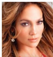
Jennifer Lopez Chief Creative Officer NUVOtv