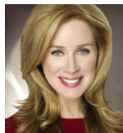
Becky Quick Co-Anchor, "Squawk Box" CNBC