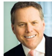
David Zaslav President & CEO Discovery Communications, Inc.