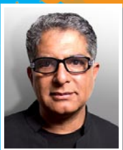
Deepak Chopra Author and Founder, Chopra Foundation and Chopra Center