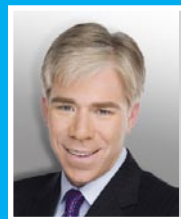
David Gregory Moderator, "Meet the Press," NBC News