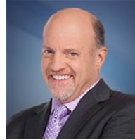
Jim Cramer CNBC