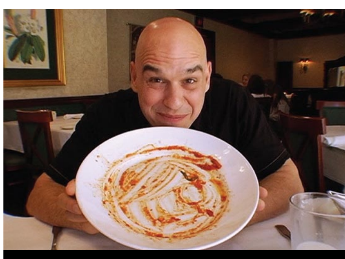
CLEAN YOUR PLATE: It's all about learning from the best.

Food through the eyes of people obsessed with food. What