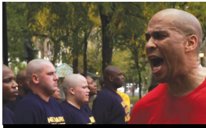
BOOK 'EM! Newark Mayor Cory Booker isn't messing around when it comes to turning around Brick City.

This doc series follows the lives of colorful characters living in Newark, NJ. It spotlights real people, with compelling stories. We're talking former gang members, activists, policemen and the city's charismatic mayor, Cory Booker. Watching the latter's attempt at turning around his metropolis is riveting stuff.