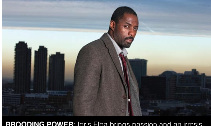
BROODING POWER : Idris Elba brings passion and an irresistable unpredictability to Luther.

As if watching Idris Elba in "The Wire" for years wasn't enough of a treat, this thespian has proven that as good as he is... he's really just getting started. Elba soars in BBC America's "Luther" as a cop willing to go to extraordinary lengths to find justice—even if that means getting in with some pretty bad people along the way. It helps that the series itself is an excellent web of mind games and double-crosses, allowing Elba to flex every muscle in his acting toolbox. But let's face it: You could cast Elba as a fry cook or mail man, and he'd find a way to make it look interesting. It's a rare actor who can combine charisma with serious acting chops. The result is pure Elba. And it's hard to imagine any other actor as Luther at this point. Maybe that's why a movie's rumored to be in the works.