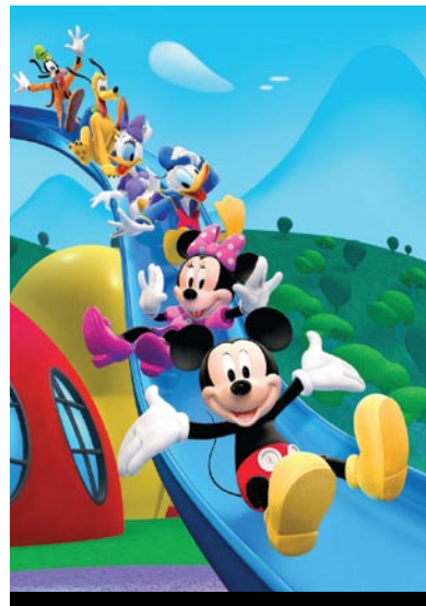
HEY MICKEY! Never one to stand still, Disney takes classic characters to new heights.