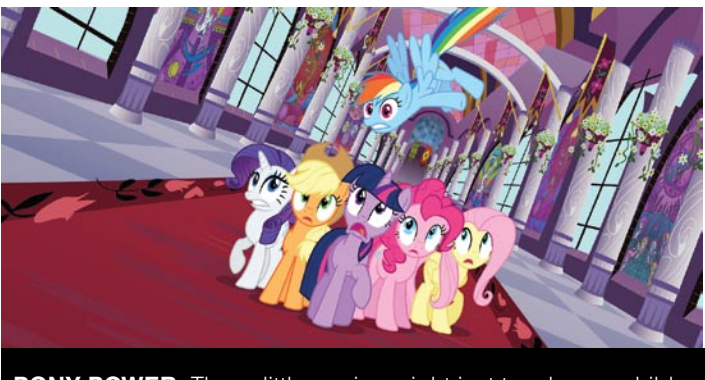
PONY POWER: These little ponies might just teach your child some life lessons in this modern reboot.

How do you revive a classic? By making the remake infinitely better than the original—fresh, vibrant animation combined with a modern day edge. A child watching this series would have no idea that her mother likely grew up watching "My Little Pony" as well. There is also a really nice moral lesson here: Twilight Sparkle is sent to Ponyville to learn the importance of friendship. Those are the same lessons the show's kid audience is navigating in real life. But it isn't just young girls who are enjoying the tales... This summer, Wired ran a feature on "Bronies," adult males who have fallen head