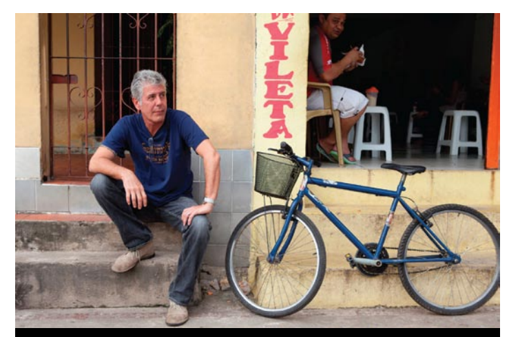
TAKING IT IN: For Anthony Bourdain, hosting is about the art of simple conversation. It works.

because he comes from the very world in which they live, but something just seems to click here. The show seems more honest than other music interview shows that places a music journalist or enthusiast in the role of interviewer. Here, it's more of a conversation about music, with a fly-on-the-wall feel that comes right through the television screen and makes us feel as if we were lucky enough to be seated one table over at a restaurant—and just so happened to eavesdrop on the conversation. All in all, an excellent show for music junkies.