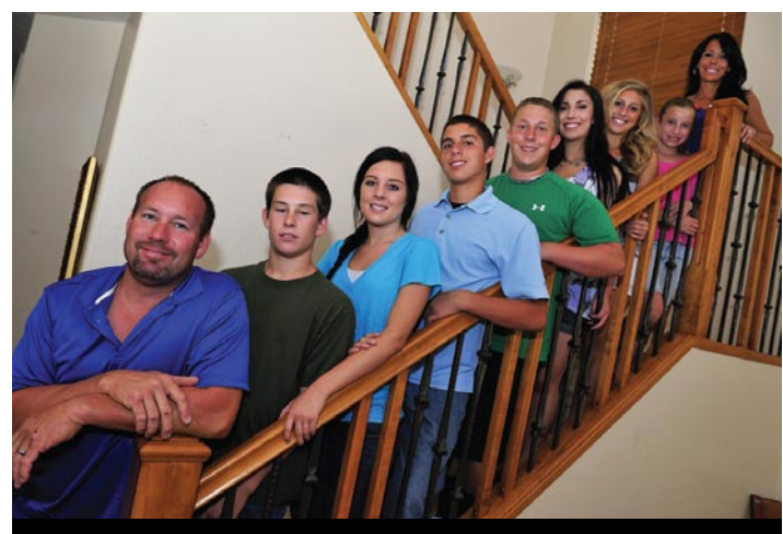
BIG FAMILY, SMALL BUDGET : Downsized follows one family as it changes its spending ways amid the economic downturn.

The economic downturn hasn't been easy on any of us. Try having 7 kids and 2 homes in foreclosure. In WE tv's "Downsized," a rather supersized family struggles to remain afloat and keep relationships intact while economic challenges rock the boat. Financial issues and the ensuing